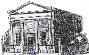
Seel St Synagogue, 1807 – 1874

Unveiling a plaque in Seel Street on the site of Liverpool's first purpose-built synagogue, our Lord Mayor recently said that the city's Jewish community had played a very significant role over many years and that its members had been prominent in public life and contributed an enormous amount to the city. The plaque forms part of the new Jewish Heritage Trail, which, the Lord Mayor said, will provide "a fascinating look at part of [our] heritage and demonstrates the importance we attach to the multi-cultural nature of the city." (Free Guide Brochures for the Trail can be obtained from the city's two Tourist Information Centres.)