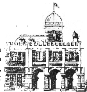
Liverpool Town Hall & Exchange, ca 1674 from "Merseyside to Windermere", Pearce, H942.721 PEA, (LRO)

One way to discover more about 17 th century Liverpool is to consult the Town Books of the period. They contain not only minutes of the meetings held to govern the town, but also information about the elections of the mayor, council & bailiffs, and the records of the Portmoot Courts. These last provide an interesting insight into the enforcement of the local laws.