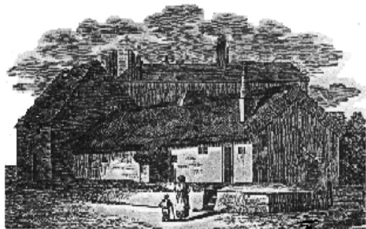
From "The Stranger in Liverpool", 7th edition H942. 7212 STR, (LRO )

“A mere crow`s nest which a parcel of boys might take”.